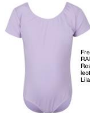
Freed RAD Rosie leotard Lilac

All students will be required to be in the new uniform by September 2026.