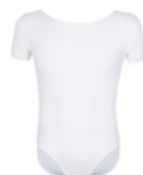
Freed RAD Rowan leotard