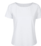
Freed RAD Heath t-shirt White