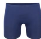
RAD Arto shorts