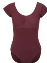
Freed RAD Fern leotard Burgundy