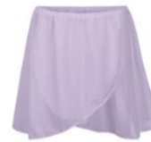
Freed RAD Belle skirt Lilac